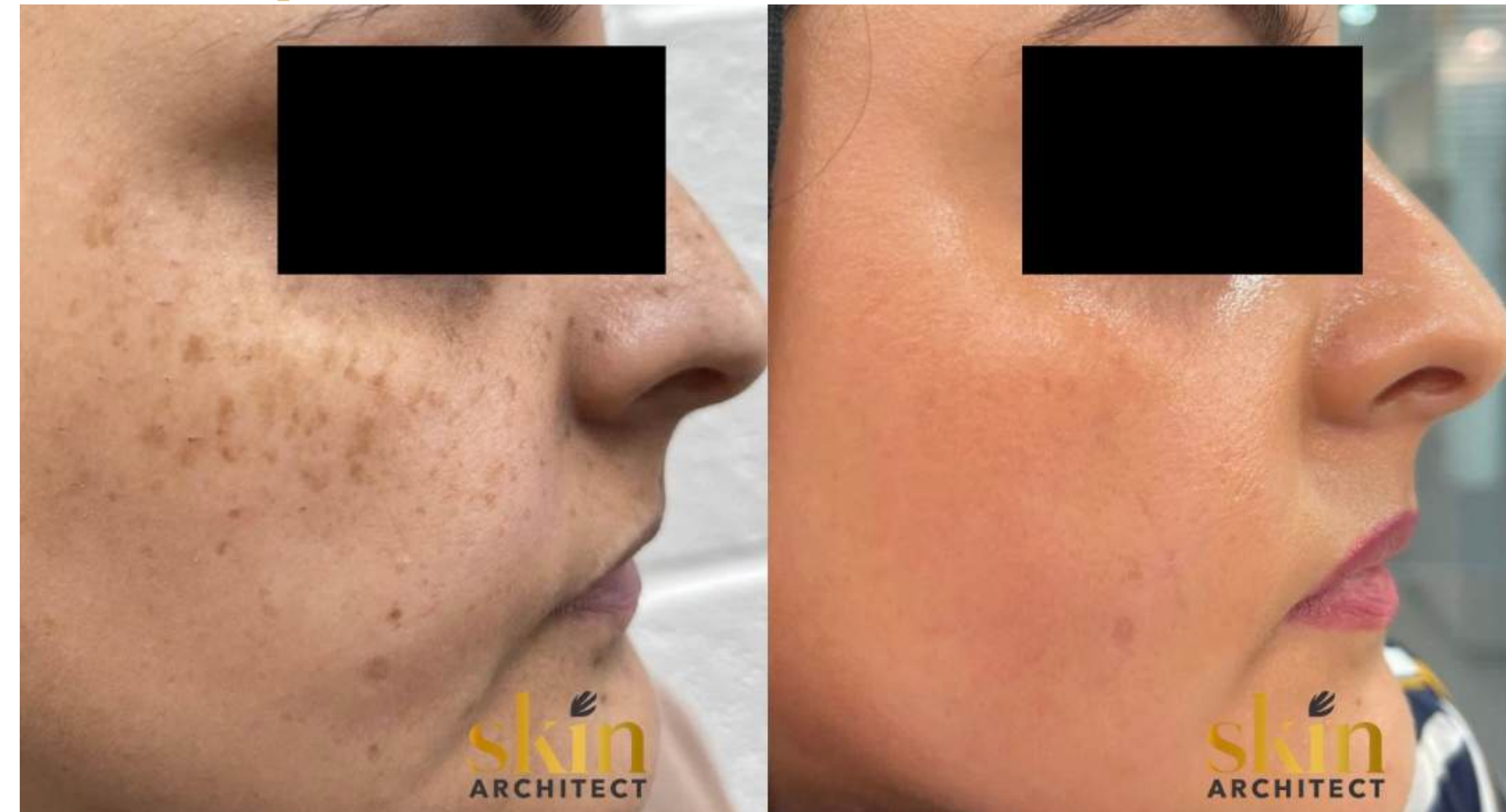
Skin Architect Clients

It's dual corrective and controlling action achieves both short and long-term results by keeping hyperpigmentation under control.